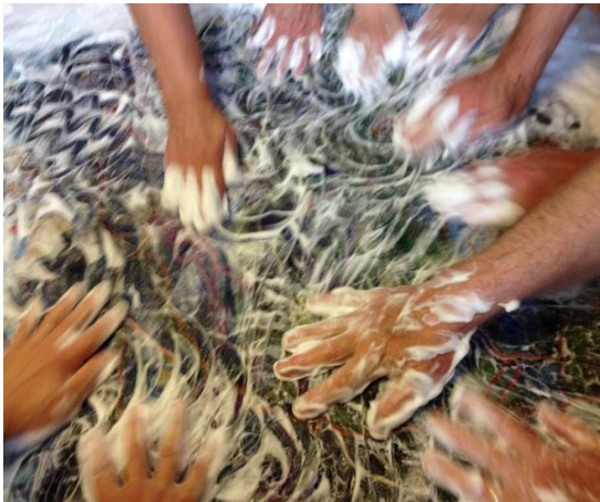
Members of the 2014 Spiritual Nurturer class making felt for a participant's project