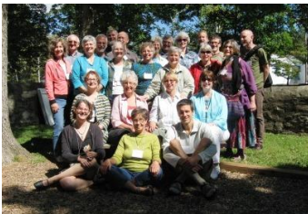
The 9th Class at Plymouth Meeting